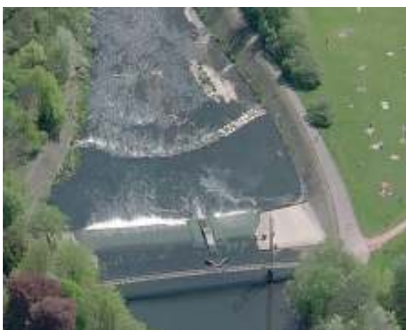
Part of the Taff Trail through Bute Park

2.9 A joint meeting was held in 2008 with Sustrans Wales and representatives of GDBA and Disability Wales to gain a better understanding of the views of the key organisations. On the same day a visit was made to a section of the Taff Trail, a long distance non-segregated traffic-free path, between Cardiff city centre and Bute Park, to see the operation of part of the trail and to visit Pedal Power, a cycle hire centre specialising in meeting the needs of disabled cyclists.