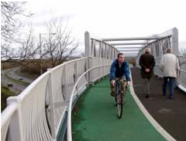
Segregated route (with substandard widths) on Cutterslowe Bridge, National Cycle Route 51, Oxford

6.22 The Guide advises that most Greenways will involve a shared surface and that its width must accommodate the number and range of users that will be attracted to use it. This will generally range from a minimum of 2m in rural areas to 3m or wider in urban areas, plus verges on either side. There will be exceptions to this, however, say where routes have to pass through pinch points (eg an existing bridge) where it may be necessary to go below normal standards. Clearly new bridges are another location where costs are high and the guide advises that it may be possible to go below the general path width, especially if the restriction is only short and has good visibility.