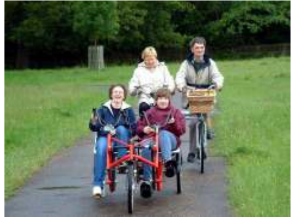
Disabled cycling, Bushy Park (Companion Cycling)

Discussions with the manager of the Pedal Power centre found that whilst there are concerns over some cyclists travelling too fast on the shared use Taff Trail, on balance she preferred the whole of the path to be available for disabled walkers and cyclists so that they had maximum flexibility in its use.