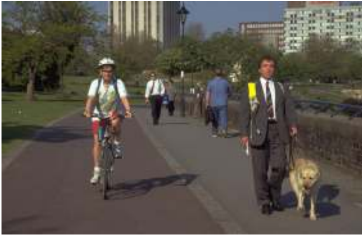
Visually impaired walker with guide dog & cyclist on segregated traffic free path, Castle Park, Bristol, National Route 4

2.6 In 2008 Guide Dogs for the Blind Association (GDBA) objected to the Sustrans initiative, as they wish to see separate paths for pedestrians and cyclists on any future traffic-free routes, something that Sustrans has difficulty in assenting to. Most of Sustrans' paths provided to date as part of the National Cycle Network have been traffic-free paths without segregation, although some sections are segregated, most commonly in urban areas.