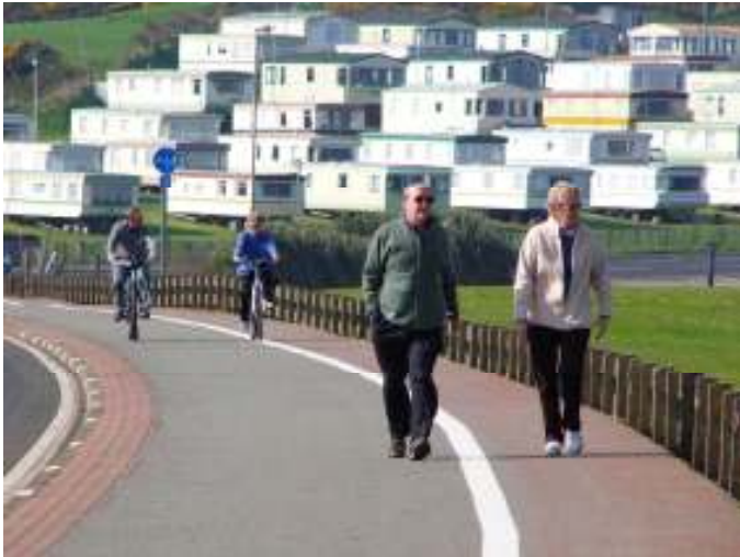
Pedestrians straying into cycle track, National Route 93, Portrush

7.51 The TRL report 583 Cycling in Vehicle Restricted Areas (2003) undertook video monitoring, speed surveys of cyclists and interviews with pedestrians and cyclists in pedestrianised streets in Cambridge, Hull and Salisbury. Average hourly pedestrian flows were between 877 and 2093 per hour (with peak flows of 1644 to 4920 per hour), average cycle flows were much lower at 14 to 116 per hour. In some of the locations cycling was banned for part of the day.