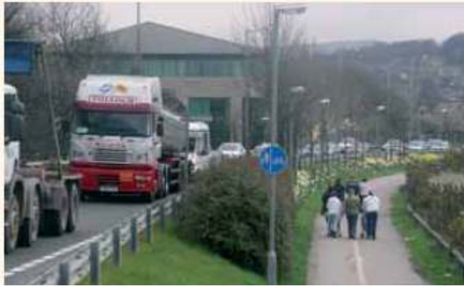
Group of pedestrians using the whole of a segregated path, Lancaster

several studies of the problem of pedestrians not keeping to the part of path designated for their use on segregated facilities.