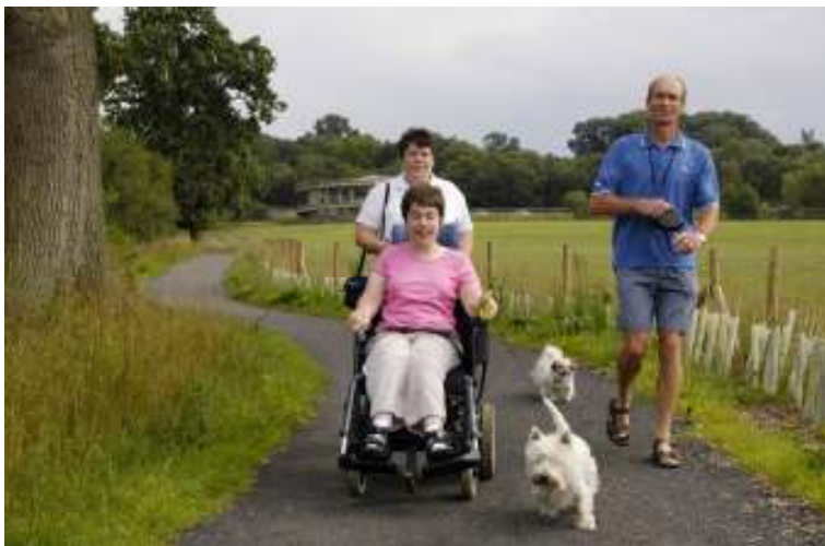
Non-segregated rural route, National Route 45, Swindon, Coate Water

5.12 Sustrans' policy says that each situation must be considered on its merits, and that where non-segregated paths are proposed, the need for publicity and education material – eg a Good Cycling Code and signs indicating a shared facility, encouraging cyclists to travel slowly and courteously past pedestrians - should be considered.