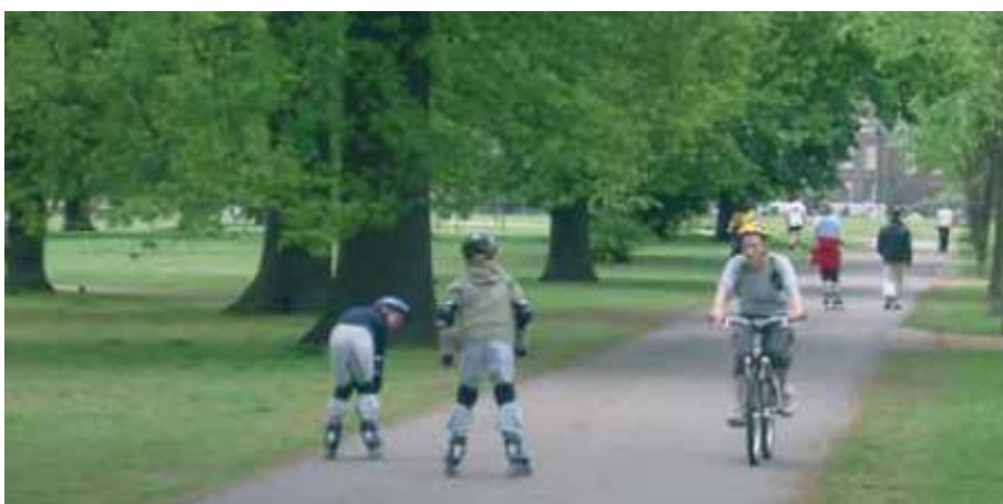
Shared Use on Palace Walk, Kensington Gardens

7.81 In the Final Report of the Kensington Gardens Shared Use Trial (2002) Atkins describe surveys carried out on two non-segregated paths – the 19m wide Broad Walk and the 4.3m wide Palace Walk – on three occasions; when cycling was banned, shortly after it was permitted and one year later.