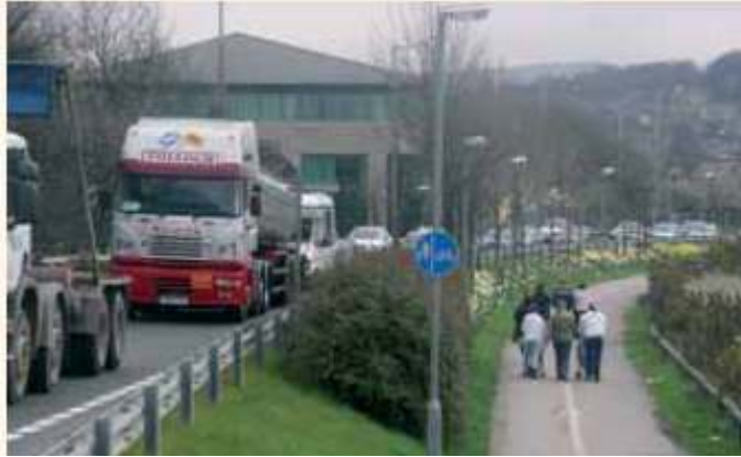
Group of pedestrians using the whole of a segregated path, Lancaster

7.21 The behaviour of cyclists and pedestrians, when they encounter one another, was analysed. It was found, as in other research, that cyclists reduce their speeds substantially when they encounter pedestrians, but the same effect was found when cyclists met other cyclists. Interestingly, pedestrians tended to increase their speed when they met other users. Cyclists tended to keep to their left when meeting others coming towards them but would pass others either on the right or left. Pedestrians show no preference for passing on the left or right. This is perhaps unsurprising as pedestrians are generally not required to follow markings when using footways and footpaths.