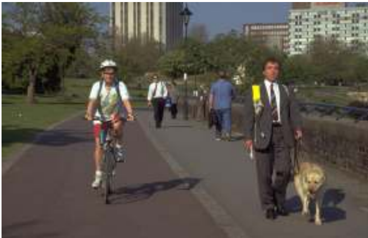
Visually impaired walker with guide dog & cyclist on segregated traffic free path, Castle Park, Bristol, National Route 4

1.17 JCMBPS therefore sets out a hierarchy of provision whereby parallel routes for pedestrians and cyclists, separated by a verge, would be the most favoured solution. Shared use (ie a non-segregated path) would only be acceptable on the most quiet and rural routes.