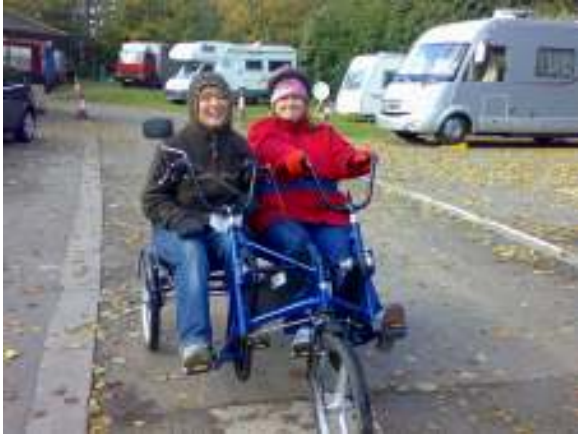
Pedal Power – ‘side by side’ tricycle (Phil Jones)

Pedal Power is a charitable organisation dedicated to making cycling accessible to all, operating from centre on the Taff Trail that hires specialist cycles to disabled people and their carers. Many of these cycles are larger than normal – up to around 1.2m in width – and often people need to walk alongside cyclists to accompany them. Similar facilities exist elsewhere – for example in Bushy Park, London.