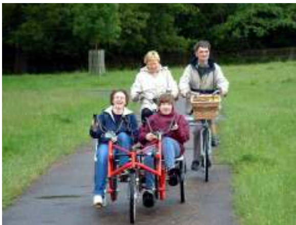
Disabled cycling, Bushy Park (Companion Cycling)

1.14 A visit to the Taff Trail in Cardiff to see the operation of a disabled cycle centre confirmed the value that disabled cyclists gain from being able to use a single level surface that can accommodate special cycles or where a carer can walk or cycle alongside them.