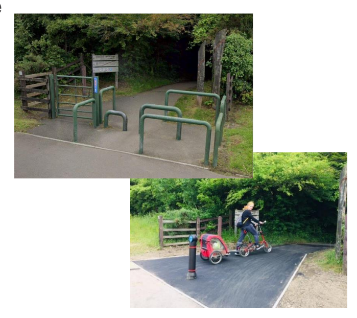
Example of completed barrier removal in Wales

Here are some examples of the impact we are having: