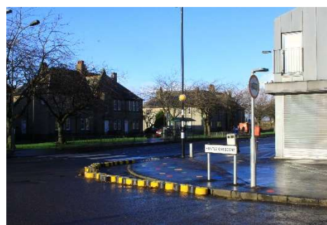
Temporary kerbs creates a tighter turn and helps slow down traffic entering Huntly Crescent.