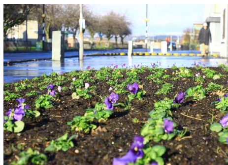
New planting on Raploch Rd at Huntly Crescent.