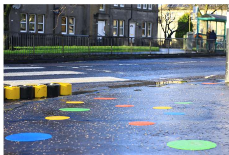
Thermoplastic features on footway add colour.