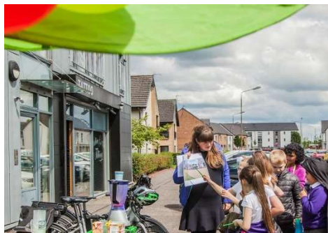
The design was developed with input from the wider community.

A new informal crossing makes it easier and safer for residents to cross the street and a temporary kerb has been installed to slow down approaching traffic. Stirling Council are currently working on a larger active travel scheme which will replace the temporary project.