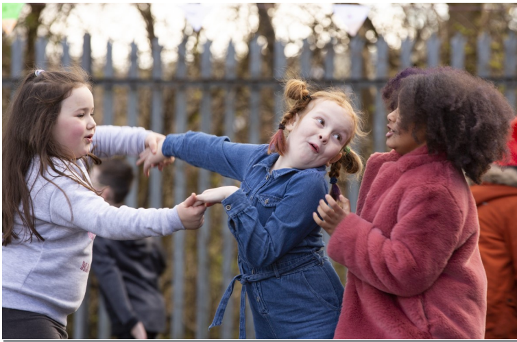
Pupils at Elmgrove Primary enjoying Feet First Families day