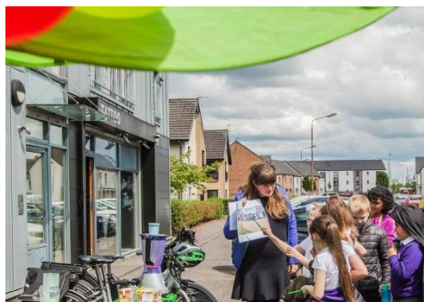
The design was developed with input from the wider community.

A new informal crossing makes it easier and safer for residents to cross the street and a temporary kerb has been installed to slow down approaching traffic. Stirling Council are currently working on a larger active travel scheme which will replace the temporary project.