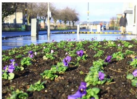
New planting on Raploch Rd at Huntly Crescent.