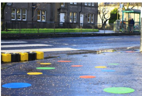
Thermoplastic features on footway add colour.