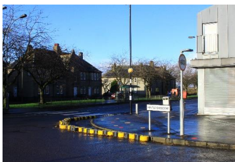
Temporary kerbs creates a tighter turn and helps slow down traffic entering Huntly Crescent.