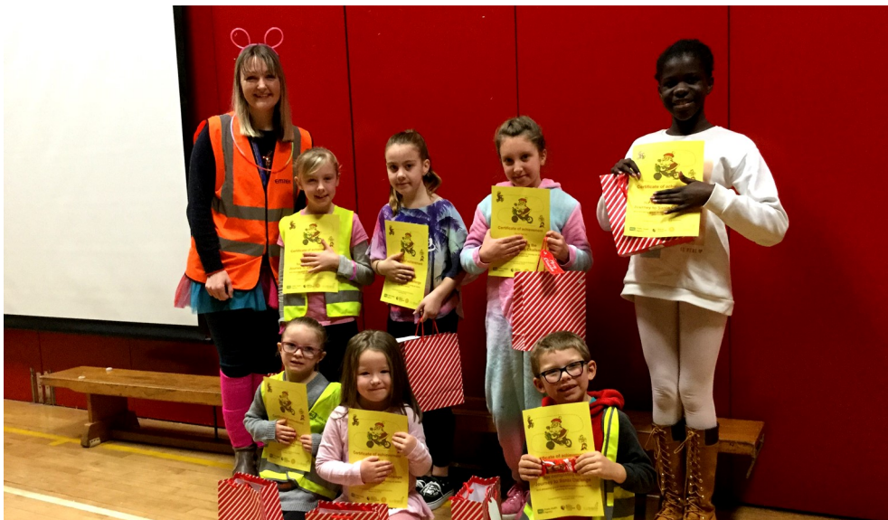
Millington Prize Winners

We are currently working with over 400 schools across Northern Ireland. Please visit our website where you can learn more about the programme and download newsletters from other areas.