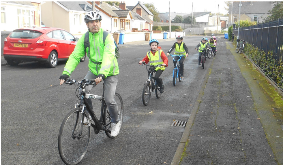
Pupils from Moyle PS taking part in cycle training

We are currently working with over 400 schools across Northern Ireland. Please visit our website where you can learn more about the programme and download newsletters from other areas.