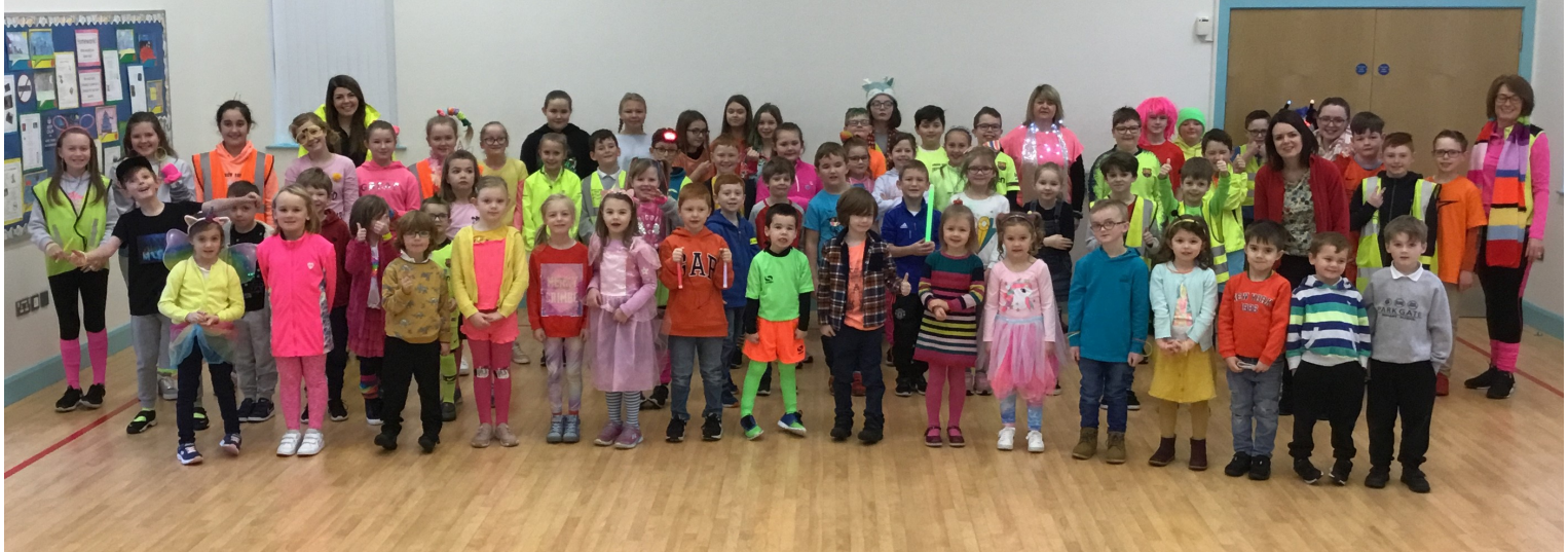
Pupils and staff from Parkgate Primary looking fantastic for their ditch the dark day

'Ditch the dark' days were again a very popular event over the Autumn, with thousands of pupils across the area walking to school wearing their brightest outfits. Promoting the road safety message of wearing bright and reflective clothes is important, especially in the darker winter days; and this is a fun way to get the message across. There are more schools planning ditch the dark days for January, so expect to see lots more bright pupils walking to school.