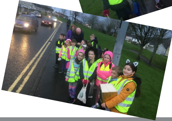
Pupils in Chapel Road PS and St Mary's Gortnahey enjoy Ditch the Dark Day