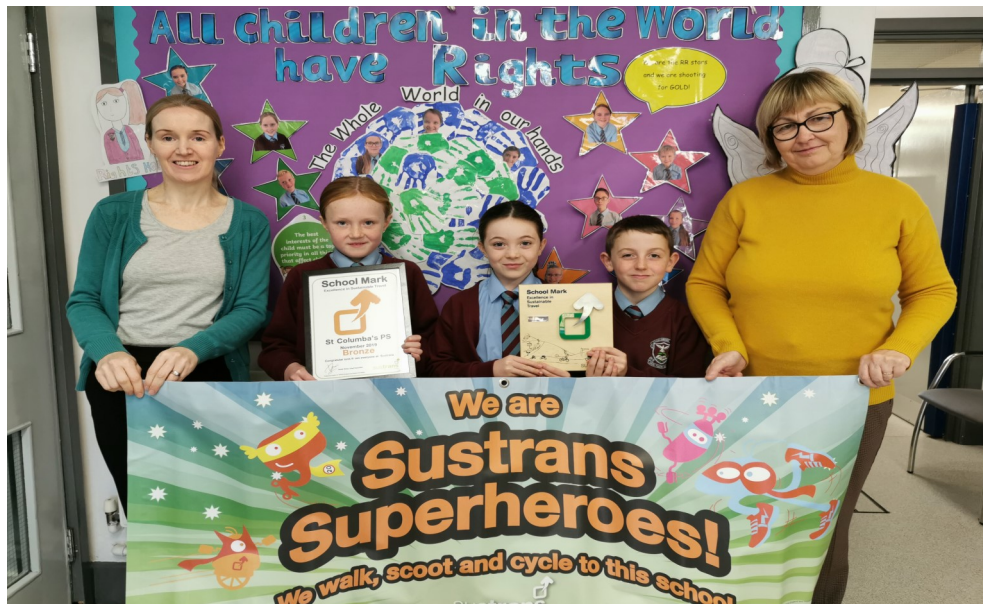
St Columba's PS, Kilrea celebrate scooping the School Mark Bronze Award

We are currently working with over 400 schools across Northern Ireland. Please visit our website where you can learn more about the programme and download newsletters from other areas.