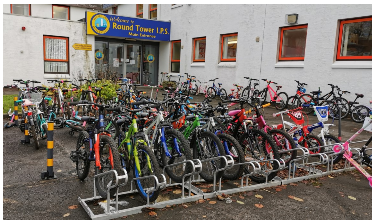
An incredible 92 bikes and scooters at Round Tower IPS

had a total of over 150 bikes and scooters tagged with a gift to reward pupils for using pedal power instead of relying on the car for getting to and from school that day. Well done everyone!