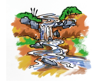
My Favourite Place