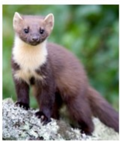
Sit quietly outdoors. Spot and sketch as many animals as you can in 15 minutes.