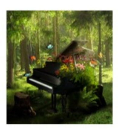
Make a new kind of musical instrument using things you find in nature.