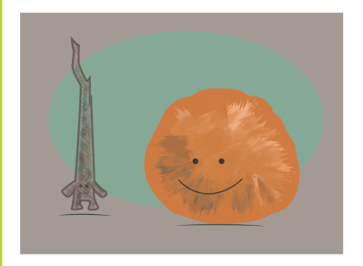
Sticks And Stones