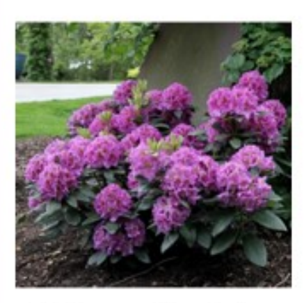
Find a non-native plant or animal that has invaded your local ecosystem.