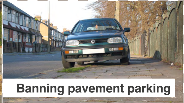
Banning pavement parking