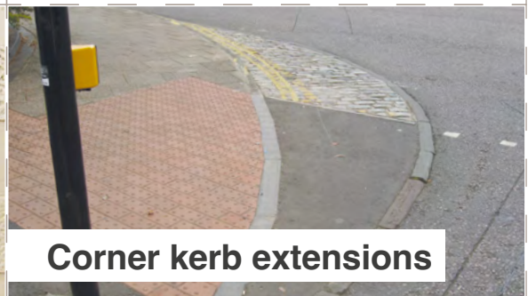
Corner kerb extensions