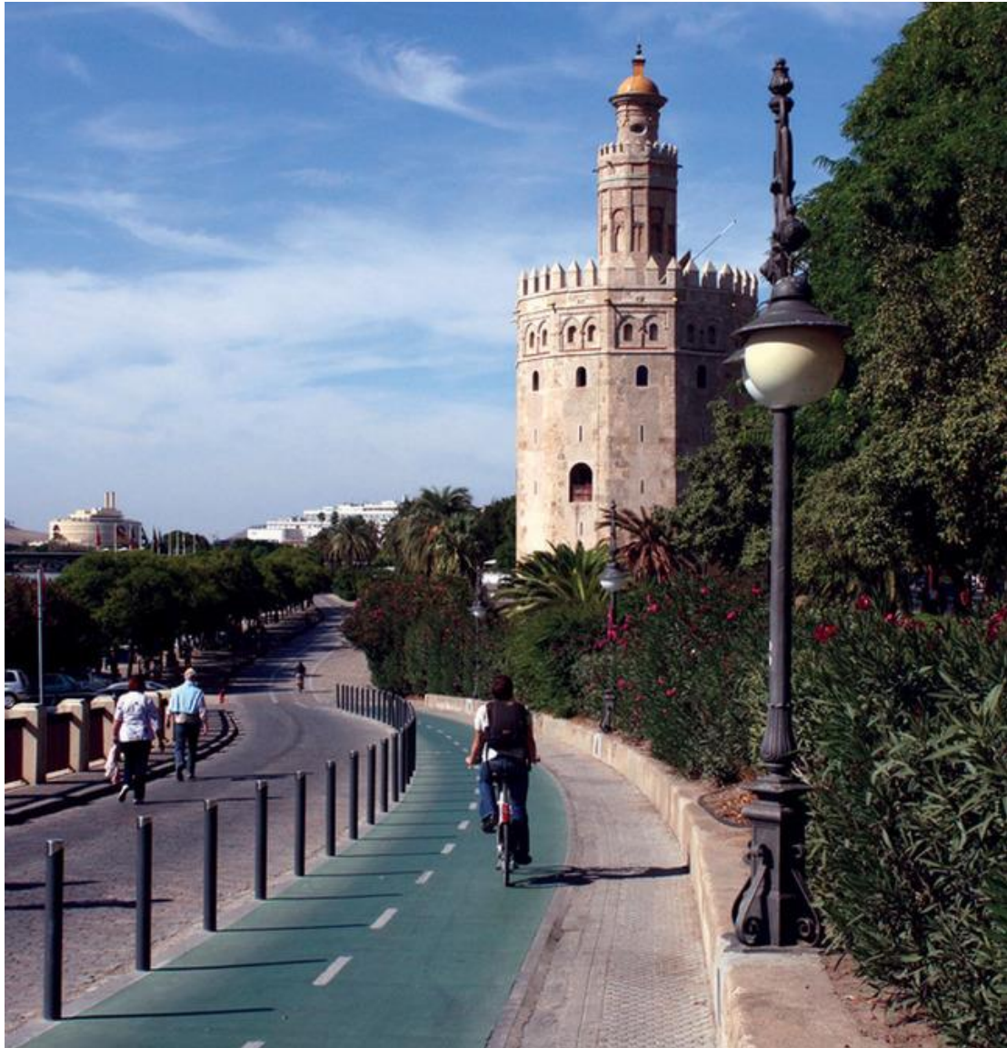
Segregated bi-directional cycle lanes in Seville

The new and expanded cycle network was the result of The Urban City Masterplan, which included a segregated bike network as part of the new city mobility system. The design of the network was first proposed through a 'theoretical network' which connected major trip attractors (e.g. intermodal centres) and relational spaces (e.g. squares, high streets). Next, taking into account on-street space constraints, the theoretical network was adjusted by optimising routes to trip attractors. The network was then proposed with 200 trip attractors located within 300m of the cycle network.