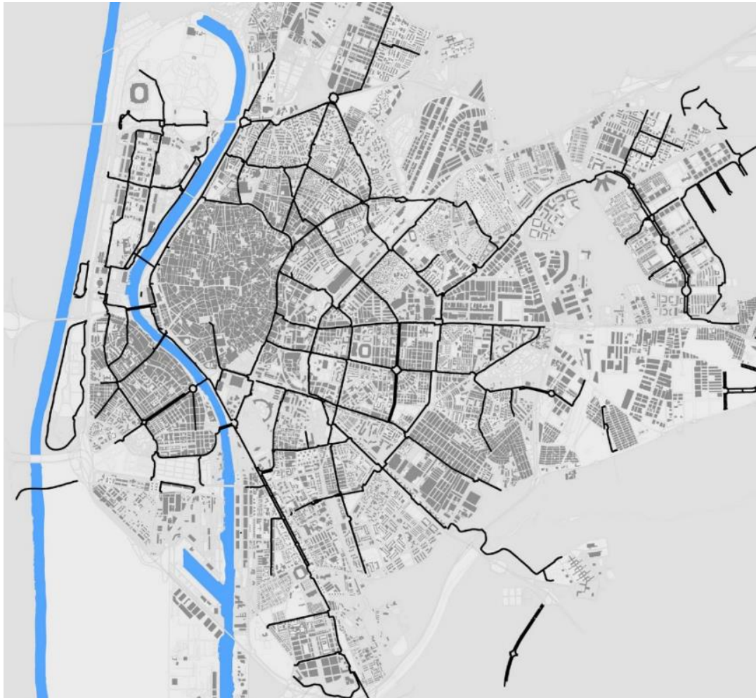
Map of Seville's cycle network in 2010 (Marqués et al., 2015)

Seville, Spain, provides an interesting and convincing case study for the effectiveness of networks, as opposed to stand-alone linear routes. From 2006 to 2011 Seville's municipal government rapidly expanded the city's provision of cycle tracks from 19km, to a network of 164km bi-directional segregated cycle tracks and shared paths. Seville experienced a jump in modal share from negligible values to 6% of all trips.