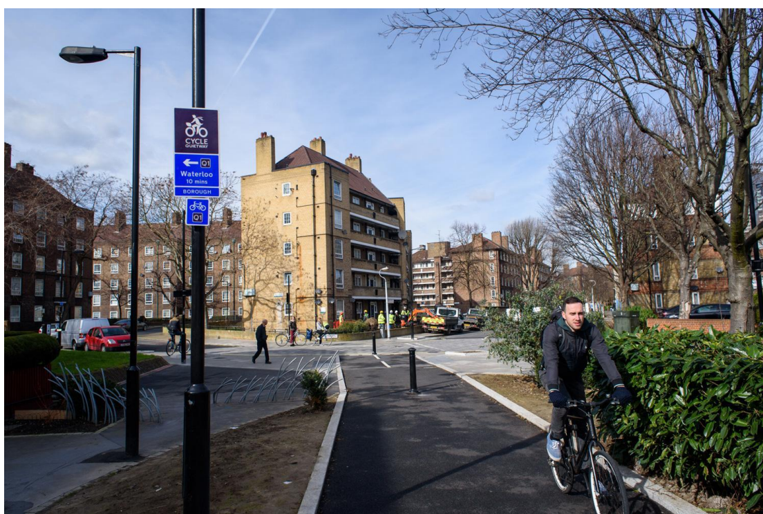
A Quietway is part of cycle network, composed of cycle tracks, signage and re-designed public realm to encourage cycling

The term 'cycle network' has been used throughout this document. Although this is a different form of infrastructure to spurs off a linear cycling route, we can still learn from the characteristics and case studies of cycle networks in understanding the effectiveness of spurs.