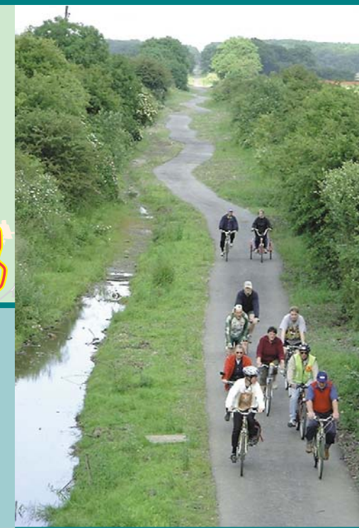
A six mile shared use path for the whole community