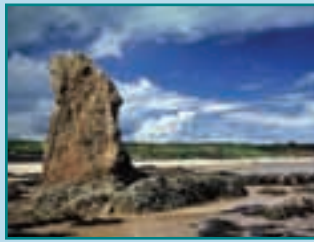
Cullen Beach