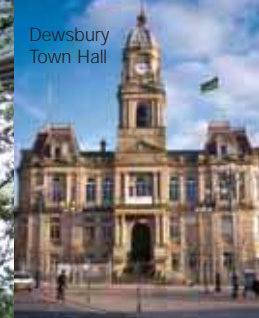
Dewsbury Town Hall