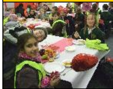
Slough Bike It Breakfast