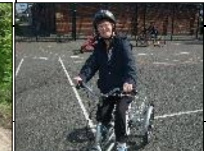
Cycle Magic Roadshow