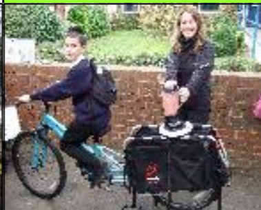
Beacon Secondary Healthy Week