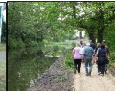
Basingstoke Canal in Woking