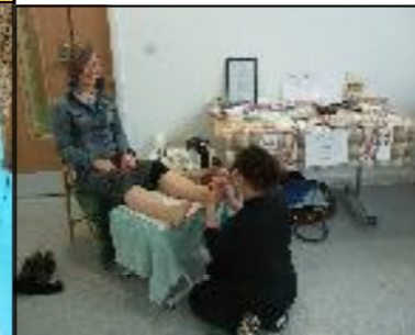
Beauty and the Bike