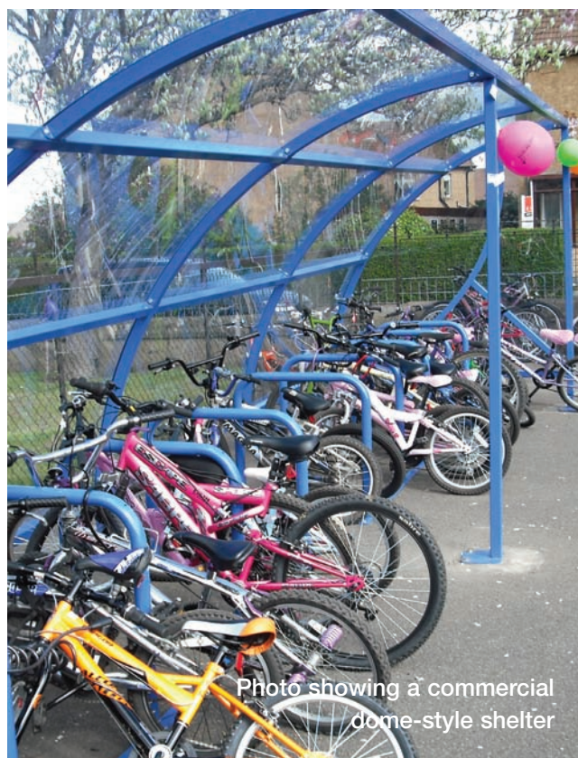
Photo showing a commercial dome-style shelter

You might like to consider a more locally sustainable eco-shelter– built using, for example locally sourced timber or by a local blacksmith, see photo.