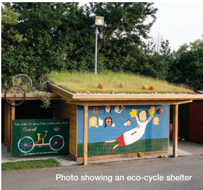
Photo showing an eco-cycle shelter

schools performing checks on pupils' bikes and have a session to help them plan their cycle routes to your school.