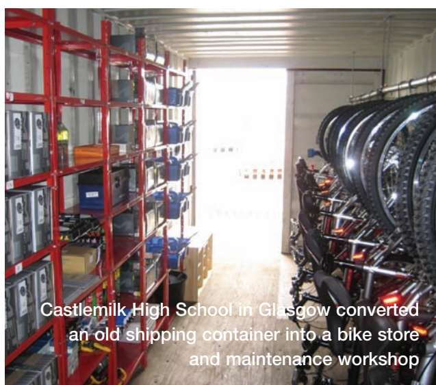
Castlemilk High School in Glasgow converted an old shipping container into a bike store and maintenance workshop

We have also compiled a list of cycle parking suppliers; see www.sustrans.org.uk/schooltravel