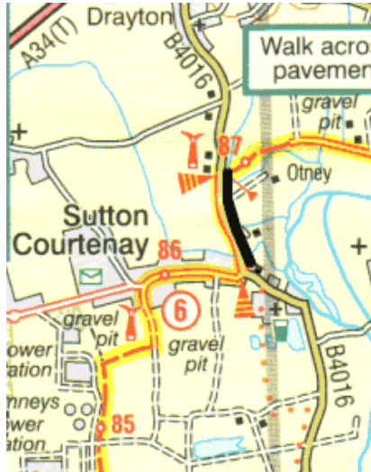
Mile 67. The link path beside the busy Drayton Road reaches back to the edge of Sutton Courtenay village. It was opened by Steven Norris, Chairman of the National Cycling Strategy Board on 13 th November 2002.