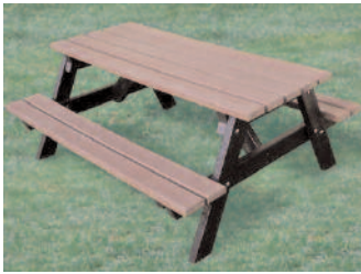
ITEM 7: Standard wood picnic table

Seating positioned perpendicular to kerb