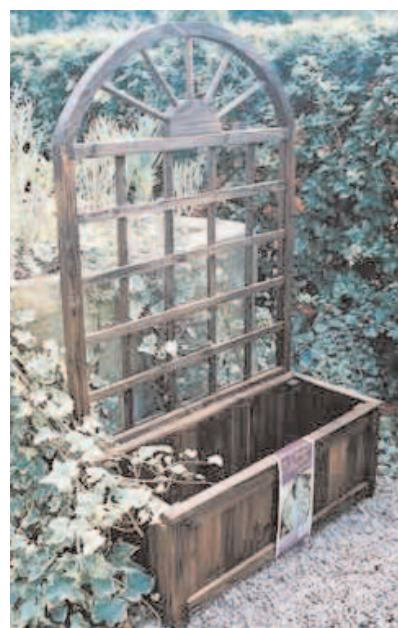
ITEM 8: (2) X Trellis-back planters