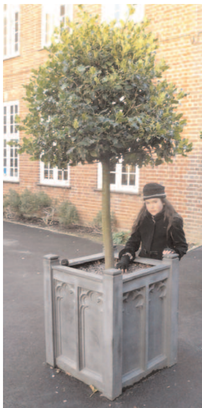
ITEMS 4, 9, 10, 13 (and alternate for 2, 15) Small Tree/Shrub Planter