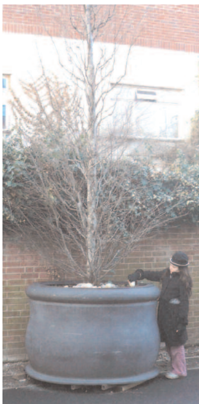
ITEMS 2, 15 Large Tree Planter