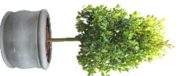
ITEMS 2, 15 Large Tree Planter