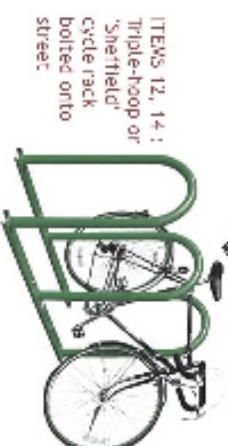
ITEMS 12, 14: Triple-hoop or 'Sheffield' cycle rack bolted onto street