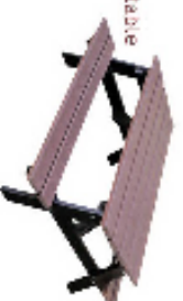
ITEM 7: Standard wood picnic table