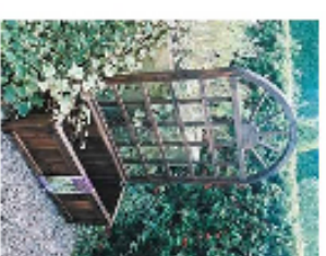
ITEM 8: Trellis-back planters