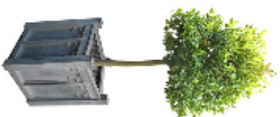
ITEMS 4, 9, 10, 13 Small Tree Planter