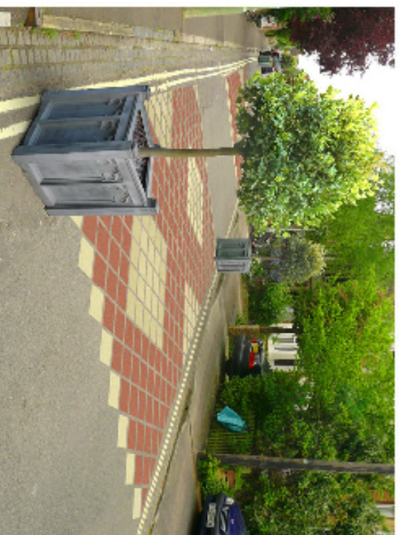
ITEMS 4, 3, 5, 11, 16, 18: Bond pattern pattern

Beech Croft Road, Summertown, Oxford OX2 Refer to specification sheet for details of these DIY features