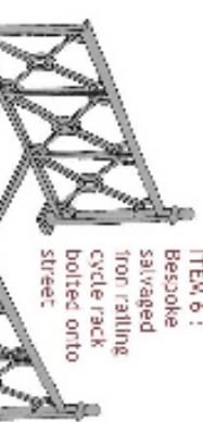
ITEM 6: Bespoke salvaged iron railing cycle rack bolted onto street