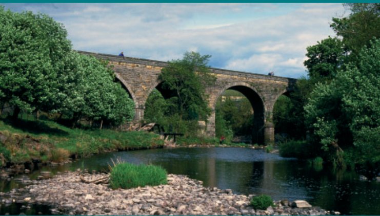
Bridge of Weir

This 20 mile cycleway and footpath forms part of the Clyde to Forth National Cycle Route. It starts at Paisley Canal Railway Station and follows the same route as National Cycle Network Route 7 until Johnstone. It then crosses attractive open country between Bridge of Weir and Kilmacolm, before reaching Port Glasgow and Greenock on the Firth of Clyde. It passes the railway station and ferry terminal in Gourock and ends at the ferry terminal at McInroy's Point. Ferries sail to Dunoon, a gateway to the Argyll area of the Loch Lomond and The Trossachs National Park.