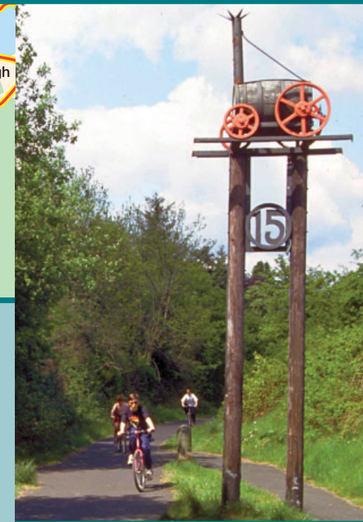
Railway Loco by D. Kemp

For more information on routes in your area: Sustrans 0845 113 0065 or visit the interactive mapping on our web site.