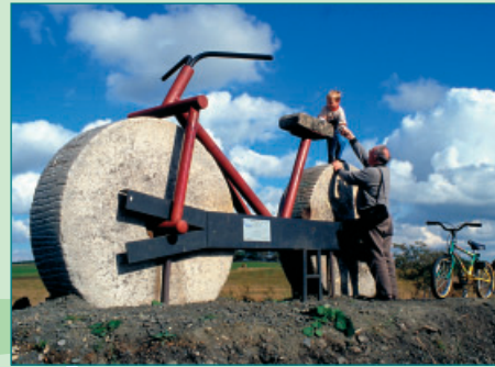
"Bedrock Bike"