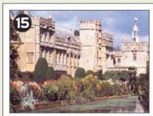
4 miles south of Chard