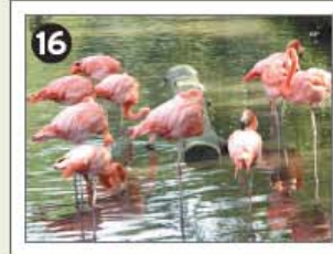
3 miles east of Chard