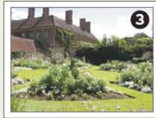
2 miles NE of Ilminster