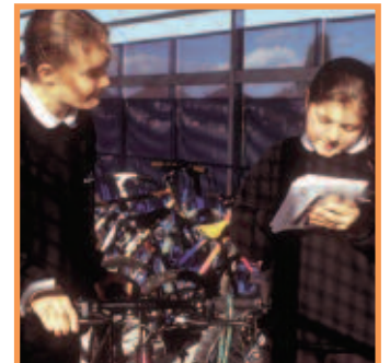
Travel to School Young TransNet survey of 175,808 pupils 2005