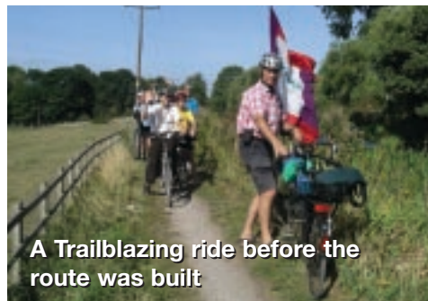
A Trailblazing ride before the route was built

The ride ends in Nailsworth, a friendly little town with excellent cafés and independent shops, and a farmer's market on the fourth Saturday of the month. If you fancy a challenge, the lovely village of Minchinhampton and its Common (managed by the National Trust) are a 2.5-mile climb away on a minor road. It's a long hill, but the views at the end are worth it.