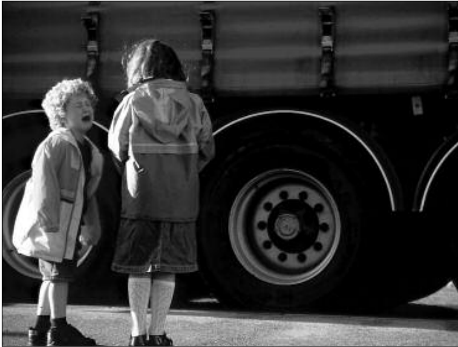
Without intending to, we have created a street environment where active travel, such as cycling and walking, is discouraged

emissions and traffic danger. Moreover, increased car use causes a spiral of behavioural changes as pedestrians and cyclists are dissuaded by the hostile traffic environment; some then drive instead. Research suggests that up to a third of car users would like to drive less, if circumstances allowed (1) .