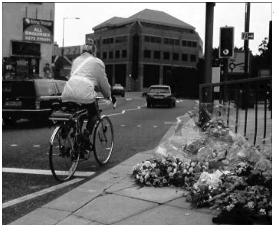
Over 3,000 people are killed on our roads each year and many more injured, yet the worst consequences of our passion for motoring may be due to insufficient physical activity

Changing to the car leads not only to loss of health benefits for the individual but also a greater health burden for the population at large: more traffic noise, vehicle