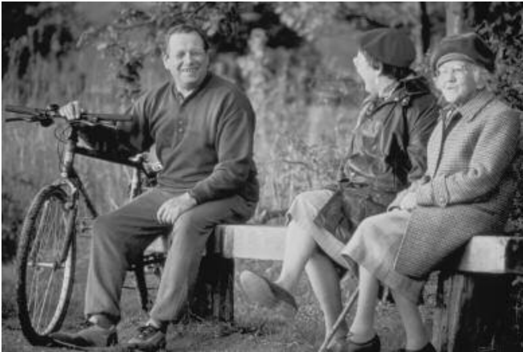
Where the car tends to isolate the user, active travel counts social contact among its benefits