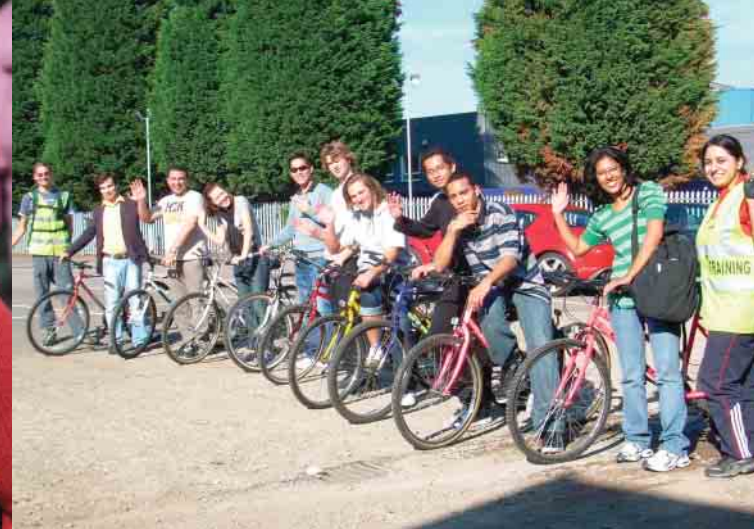
Train to lead a walk or cycle group and help your community to get active!