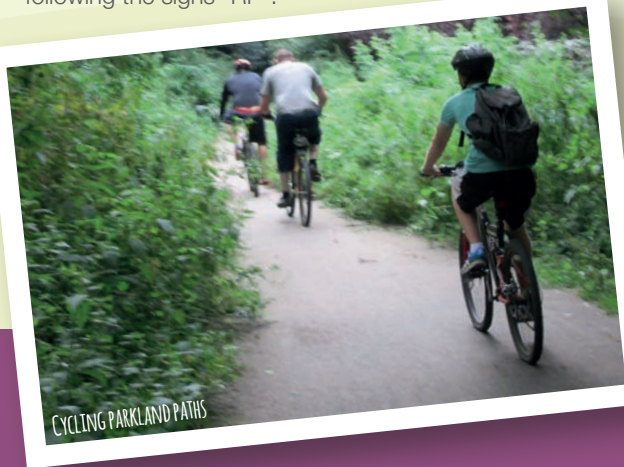
CYCLING PARKLAND PATHS